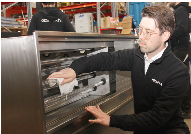
The Aurora UV system lines are design with superior maintenance flexibility and parts replacement.

Elektravägen 53 SE-126 30 Hägersten, Sweden +46 10 252 30 00 www.mellifiq.com